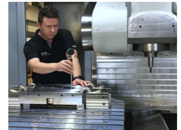
The HASCO special production even faster, more precise and more flexible by using the MCC 800 A.